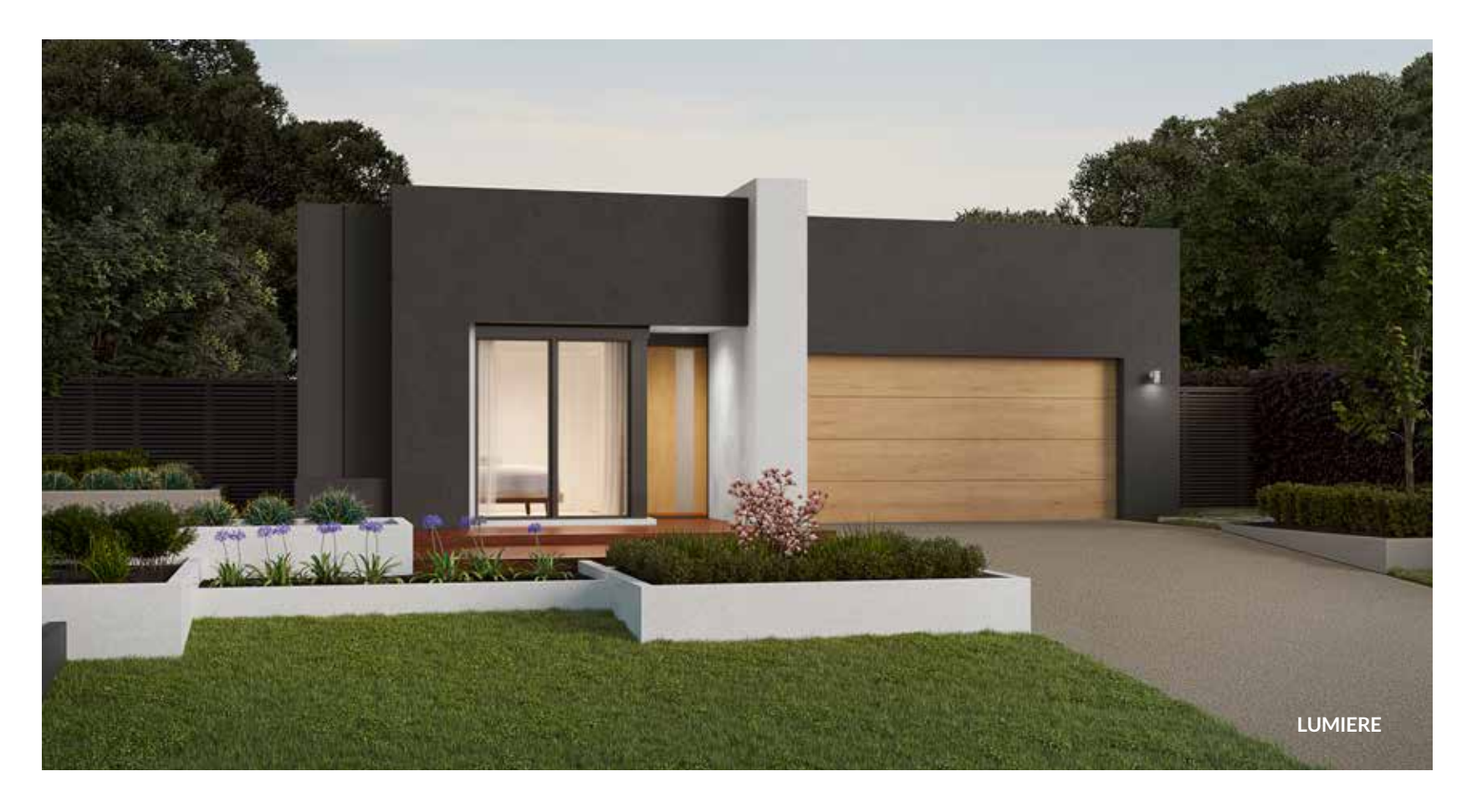
Facades are shown as Artists impressions only. The prices quoted are for face bricks and roofing from our selected range. More floor plan options and additional facades available – see your Building and Design Consultant for further details.