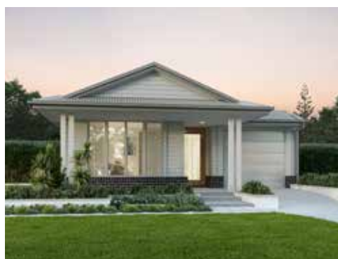
Newfold B facade

Block width/depth suitability may vary by council or approval authority. Please refer to the back page for an important notice.