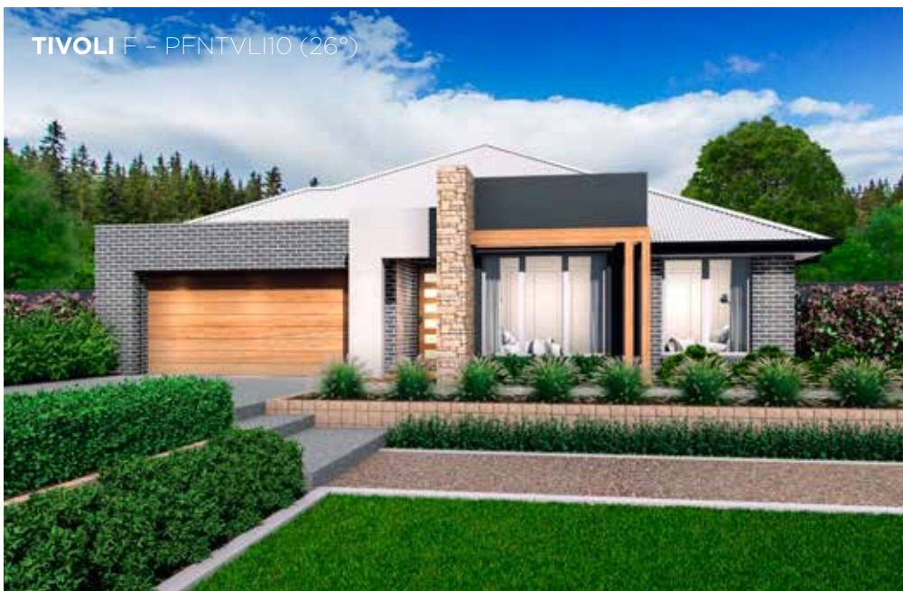
TIVOLI F - PFNTVLI10 (26°)