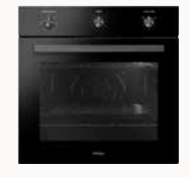
OVEN * (HWO60S4LMB2)