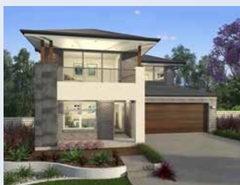
Apollo B F-SVSAPOB01