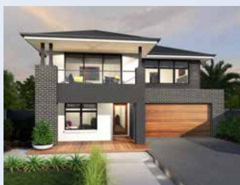
Apollo B F-SDNAPOB01