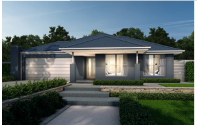
Traditional F-AMLTRAD01 (26°)