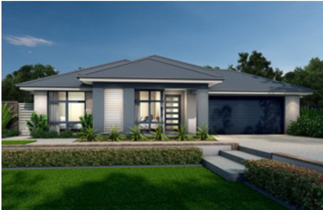
Balinese Tropicana D F-AMLBATD01 (26°)