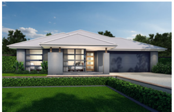
Contemporary F-AMLCTMP01 (26°)