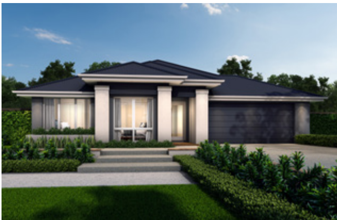
Provincial F-AMLPROV01 (26°)