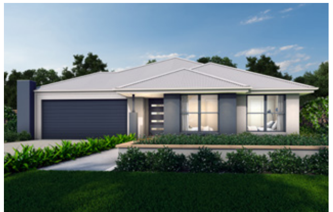
Classic F-AMLCLAS01 (26°)