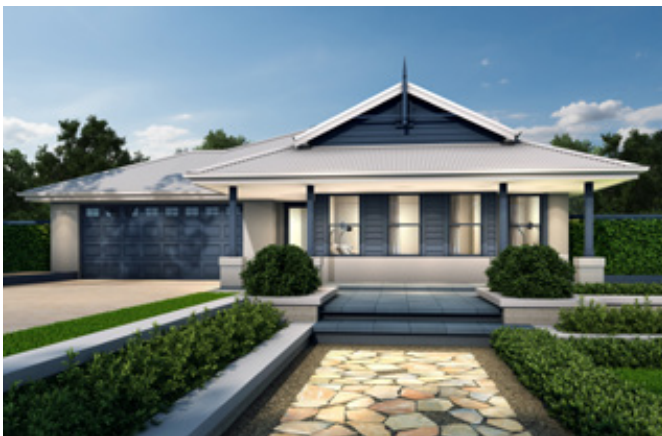
Chatsbury F-AMLCHAT01 (26°)