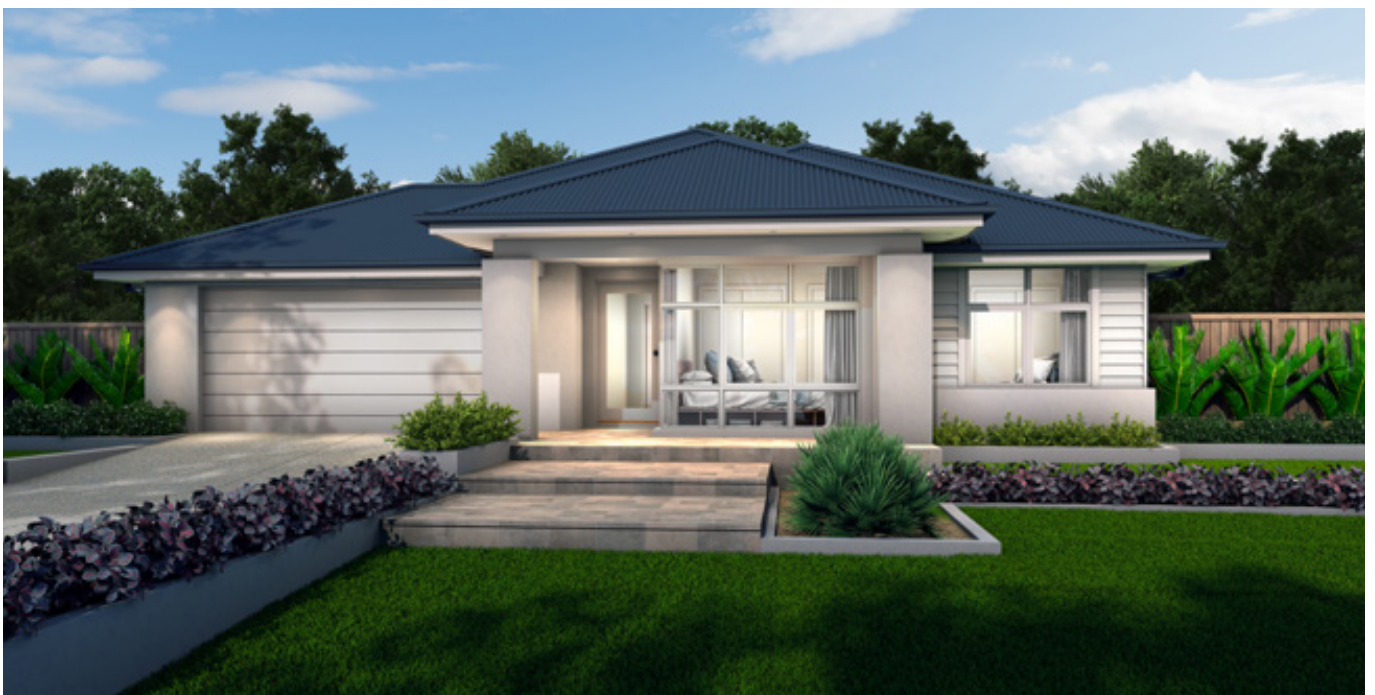
Cascade C F-AMLCASCA01 (26°)