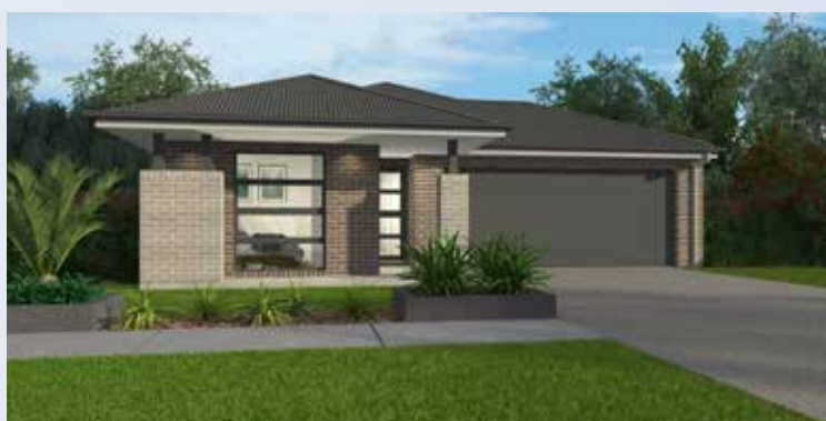
Contemporary C F-VNTCTMC01