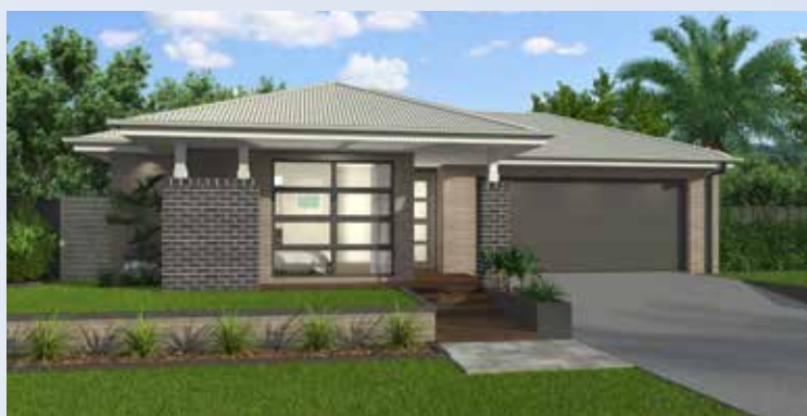
Contemporary C F-MCLCTMC01

Floor Plan portrays the Classic facade and will differ slightly with various facades (for example window locations may differ). Facade renders shown reflect 2550mm ceiling height upgrade.