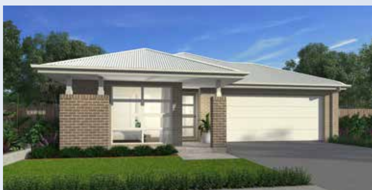
Contemporary C F-LGDCTMC01