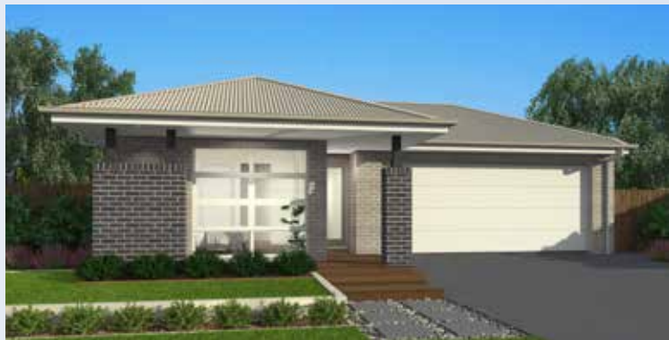
Contemporary C F-KMNCTMC01