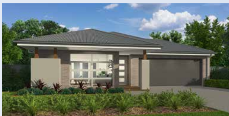
Contemporary C F-DMLCTMC01