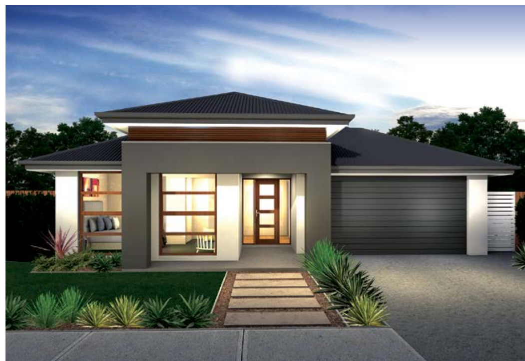
Balinese Tropicana F-VEVBATA01 (26°)