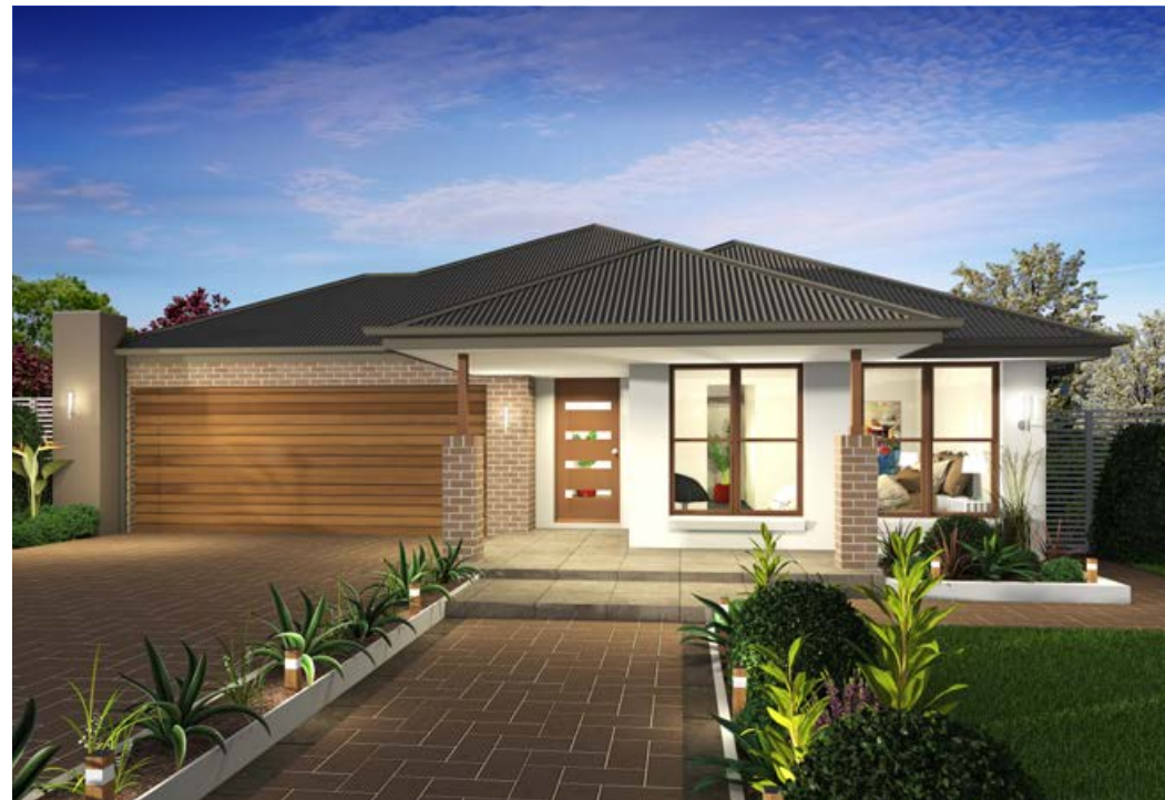
Traditional F-VEVTRAD01 (26°)