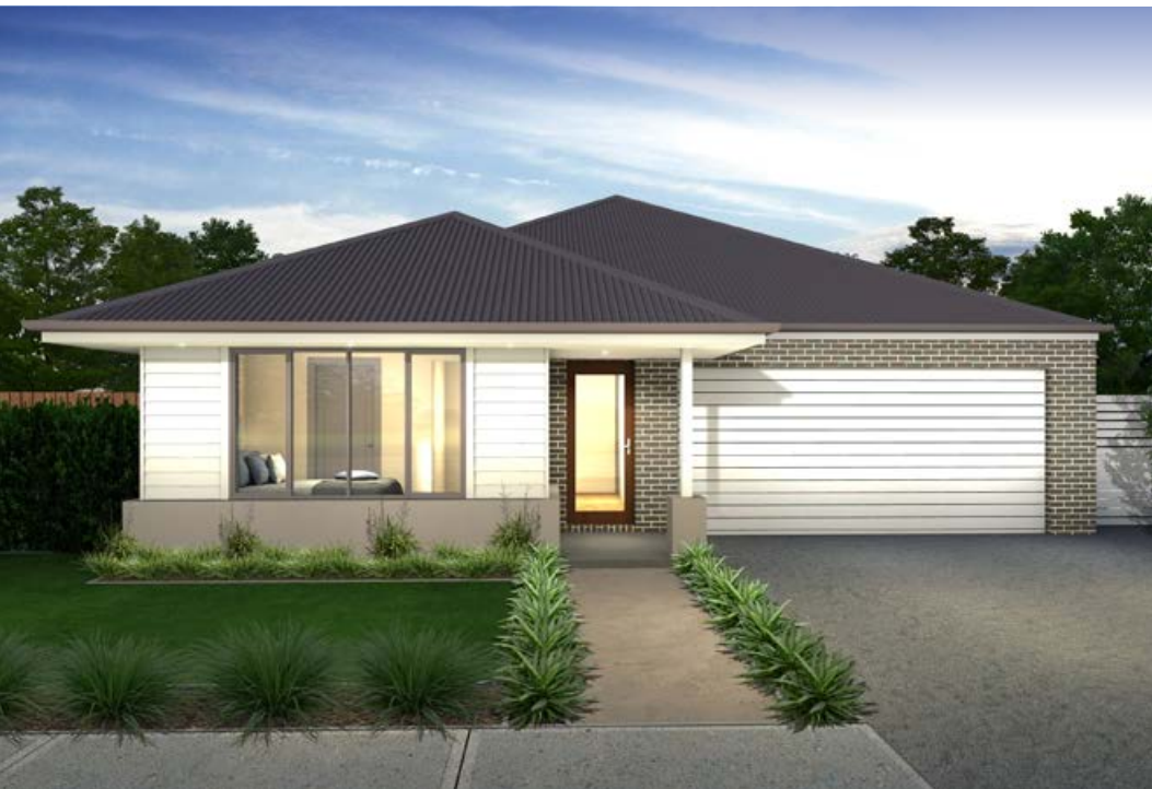
Country Classic F-VEVCOCL01 (26°)