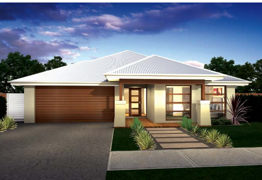
Balinese Resort F-VEVBART01 (26°)