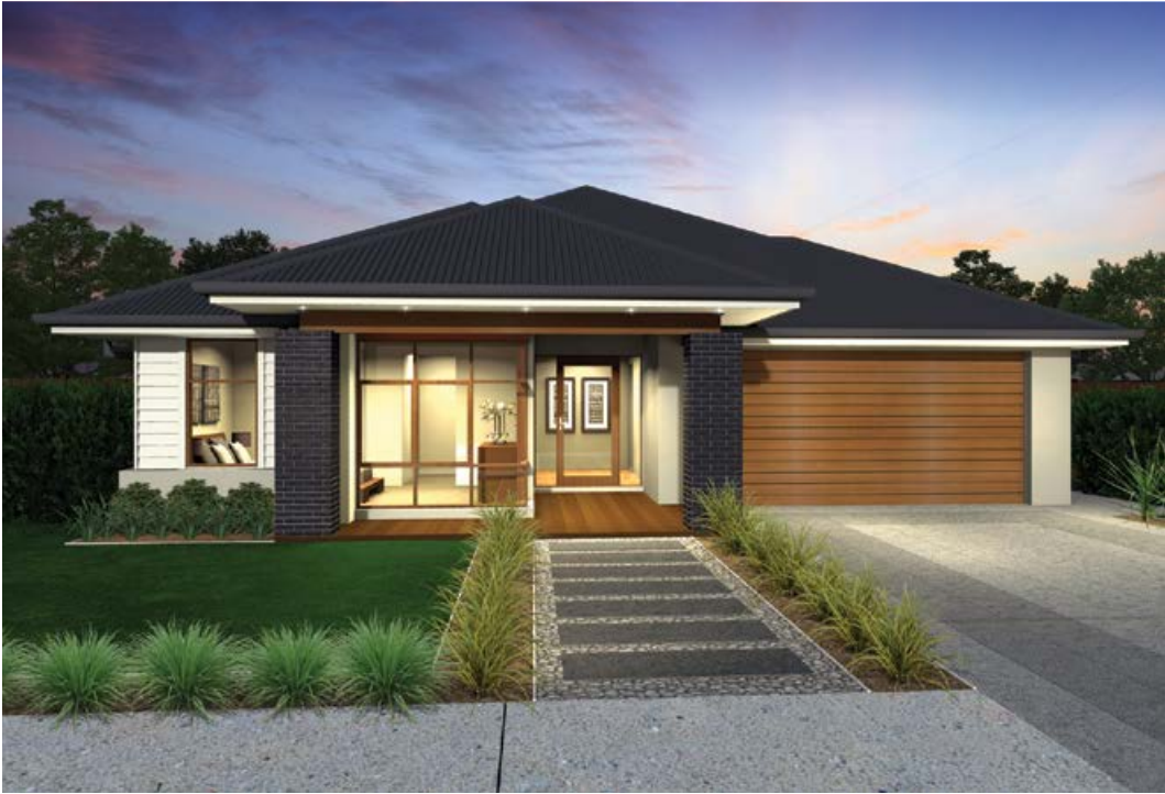
Cascade C F-VEVCASC01 (26°)