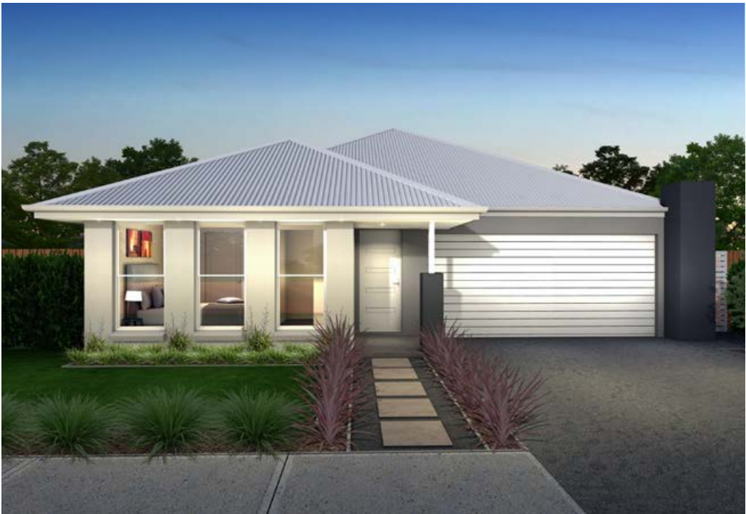
Classic F-VEVCLAS02 (26°)