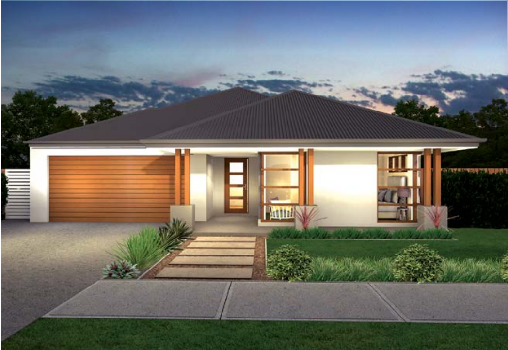
Metro A F-VEVMETA01 (26°)