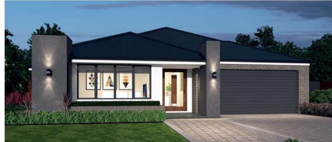
Roma F-VGDROMA01 (26°)