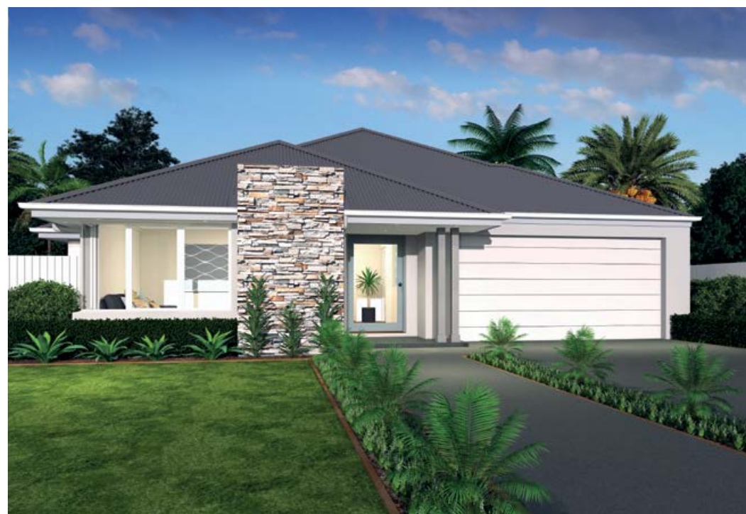
Lisbon B F-VGDLSBN01 (26°)