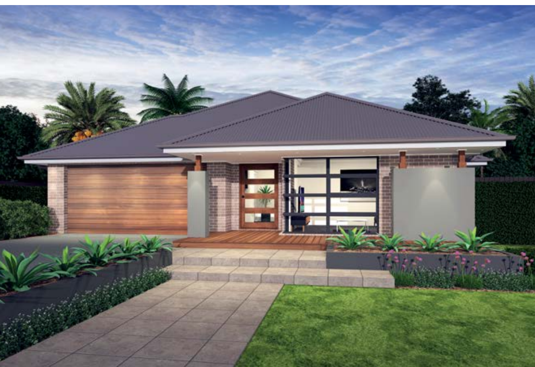
Contemporary B F-VGDCTMP01 (26°)