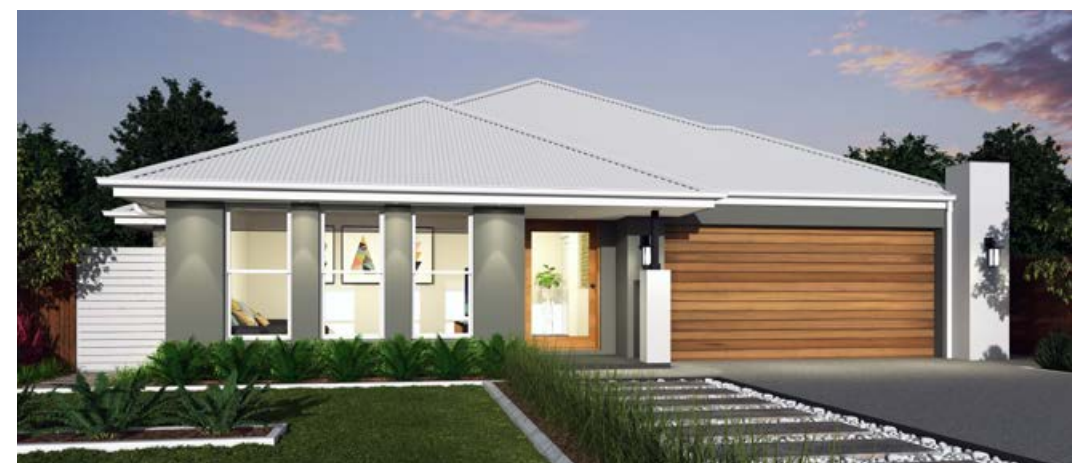
Classic F-VGDCLAS01 (26°)