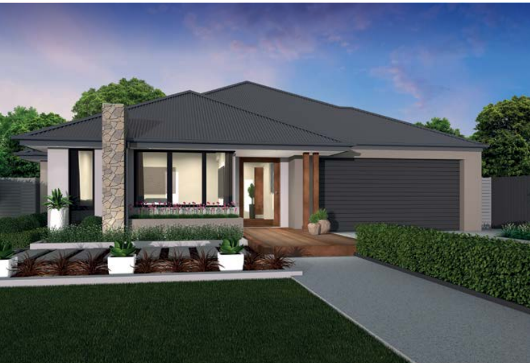
Prague F-VGDPRAG01 (26°)