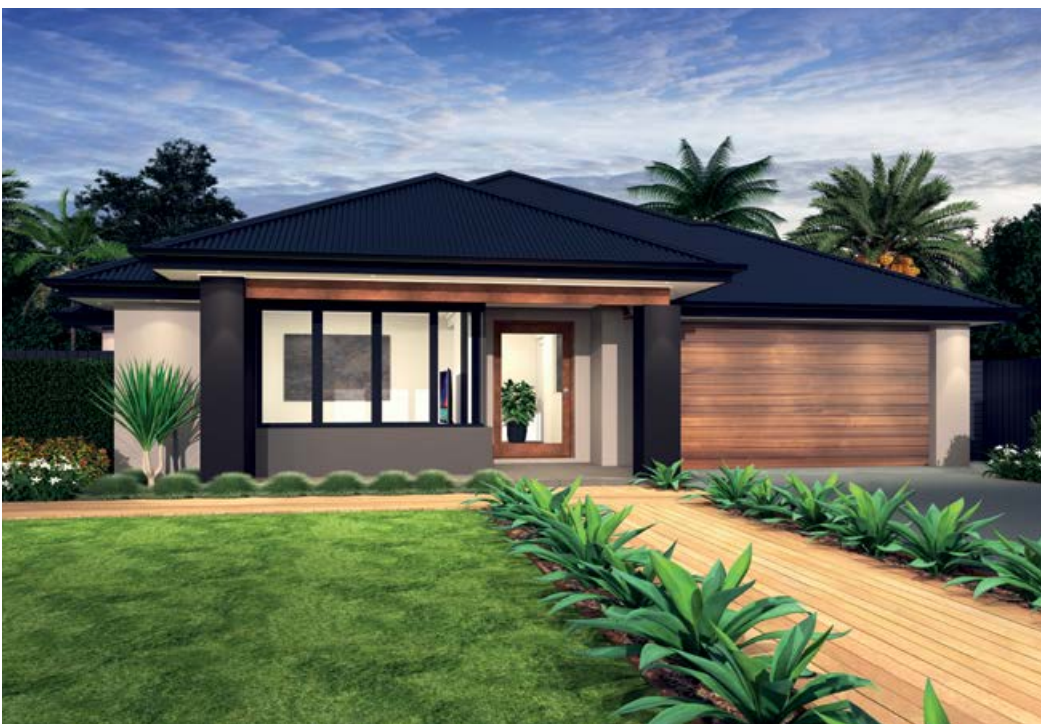
Coogee F-VGDCOGE01 (26°)