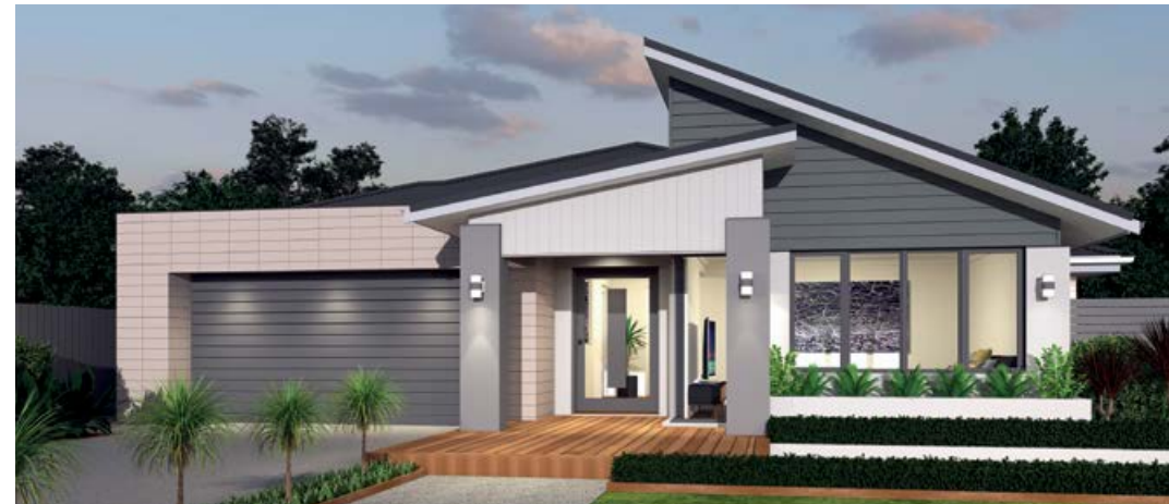
Noosa B F-VGDNOSB01