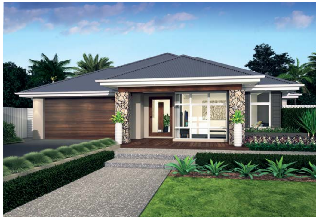
Cascade B F-VGDCAS01 (26°)