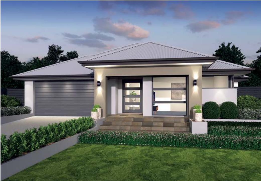
Newton F-VGDNWTN01 (26°)