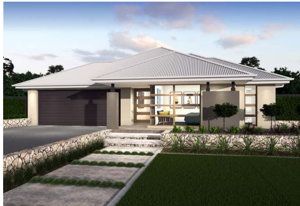
Contemporary F-STNCTMP01 (26°)