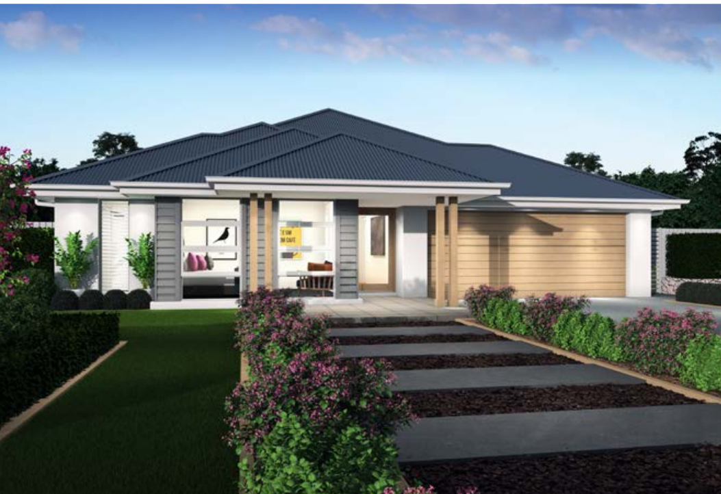
Haven F-STNHAVN01 (26°)