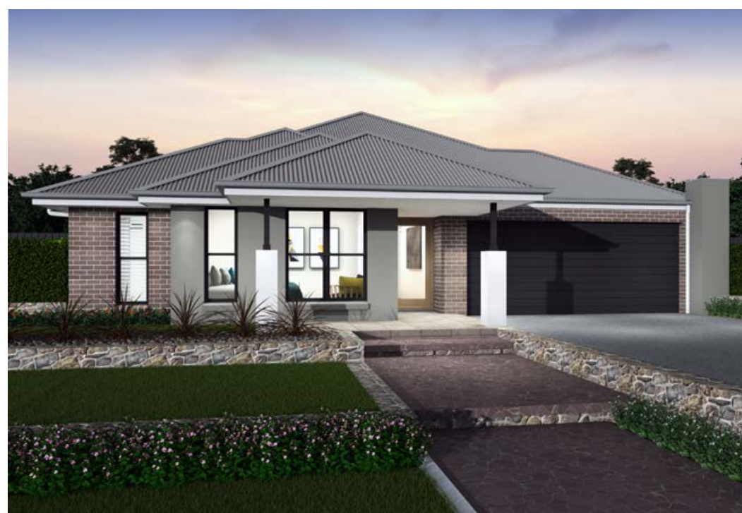
Traditional F-STNTRAD01 (26°)