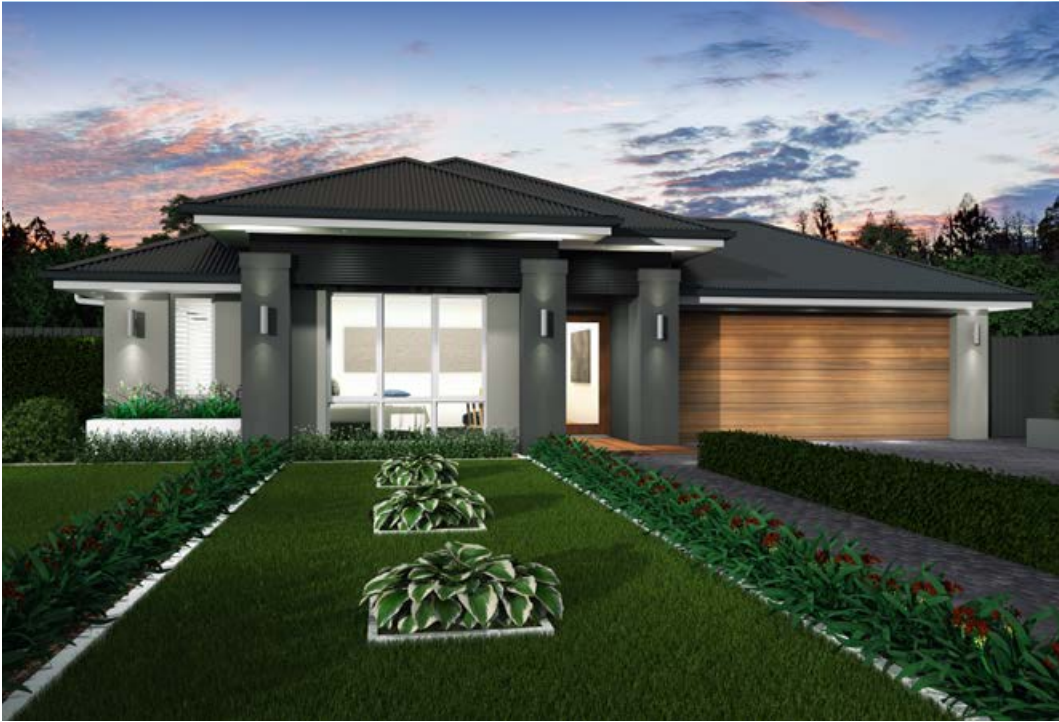
Provincial F-STNPROV01 (26°)