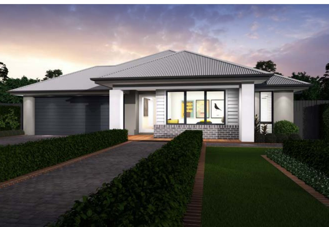
Leon F-STNLEON01 (26°)