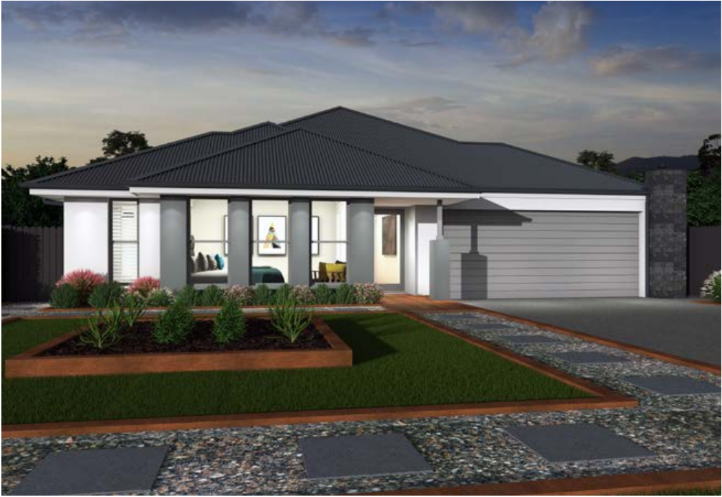
Classic F-STNCLAS01 (26°)