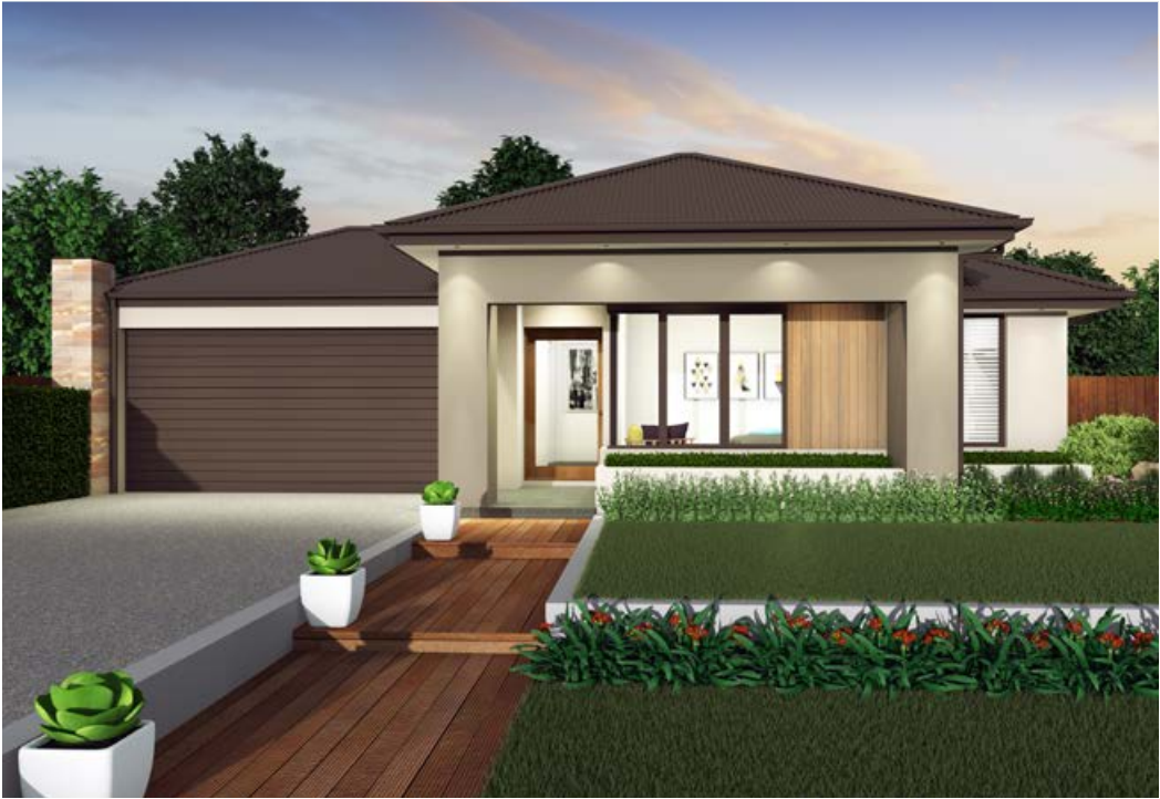
Ainslie F-STNAINS01 (26°)