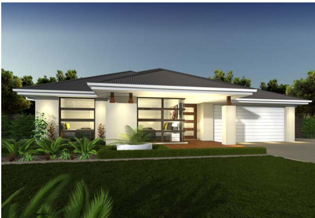
Contemporary F-SVRCTMP01 (26°)