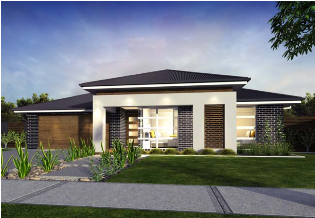
Balinese Tropicana B F-SVRBATB01 (26°)