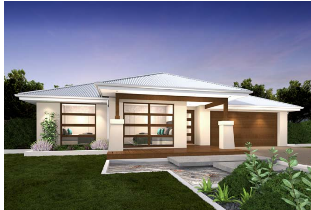
Balinese Resort F-SVRBART01 (26°)