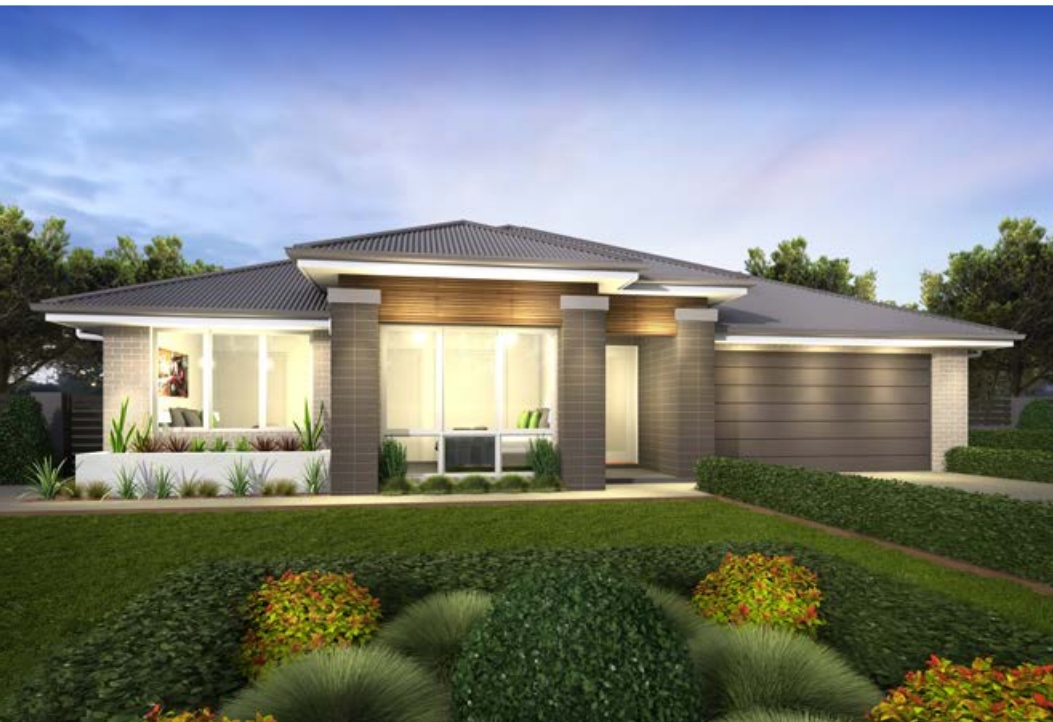
Provincial F-SVRPROV01 (26°)