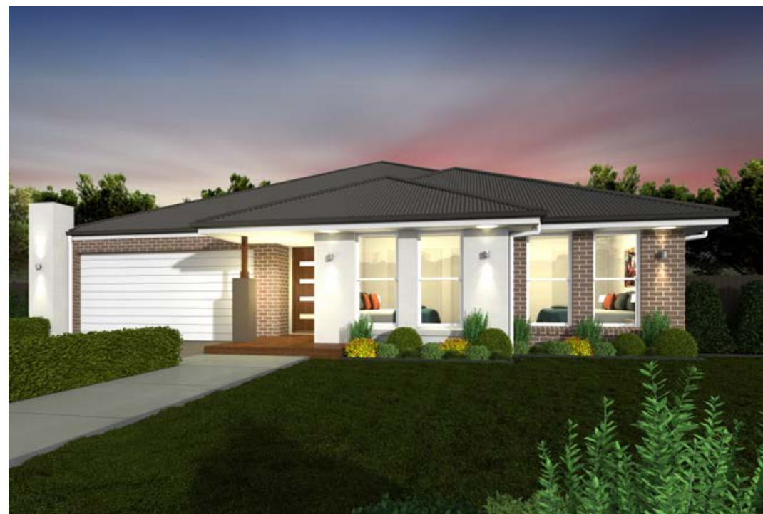
Classic F-SVRCLAS01 (26°)