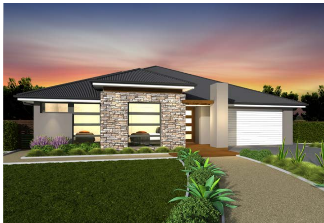
Villa C F-SVRVILC01 (26°)