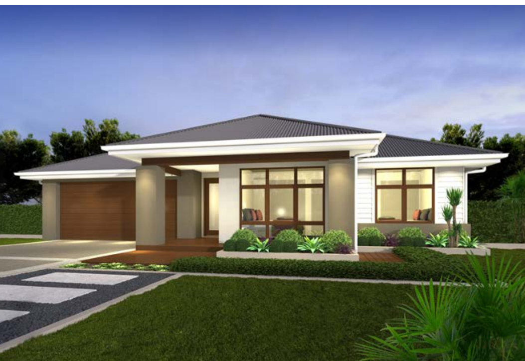
Cascade D F-SVRCASD01 (26°)