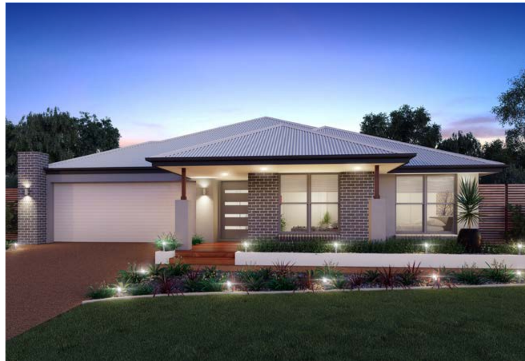
Traditional F-SVRTRAD01 (26°)