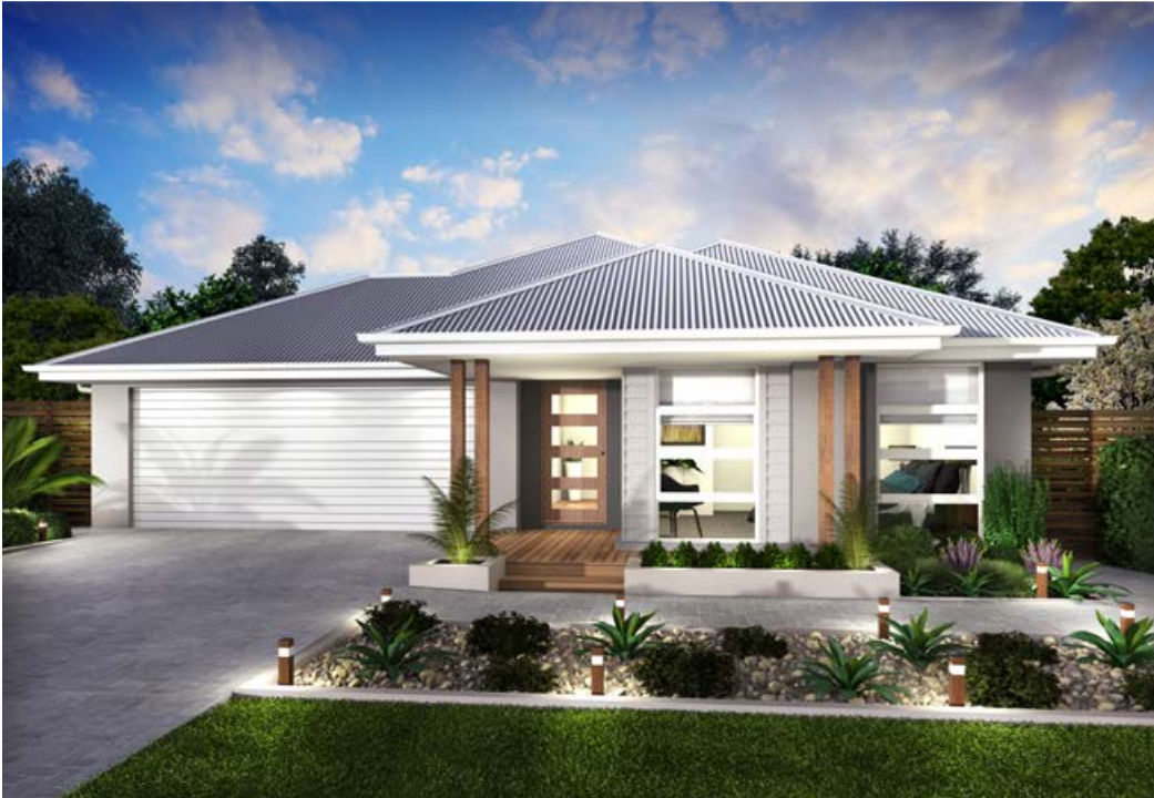
Haven F-SNDHAVN01 (26°)