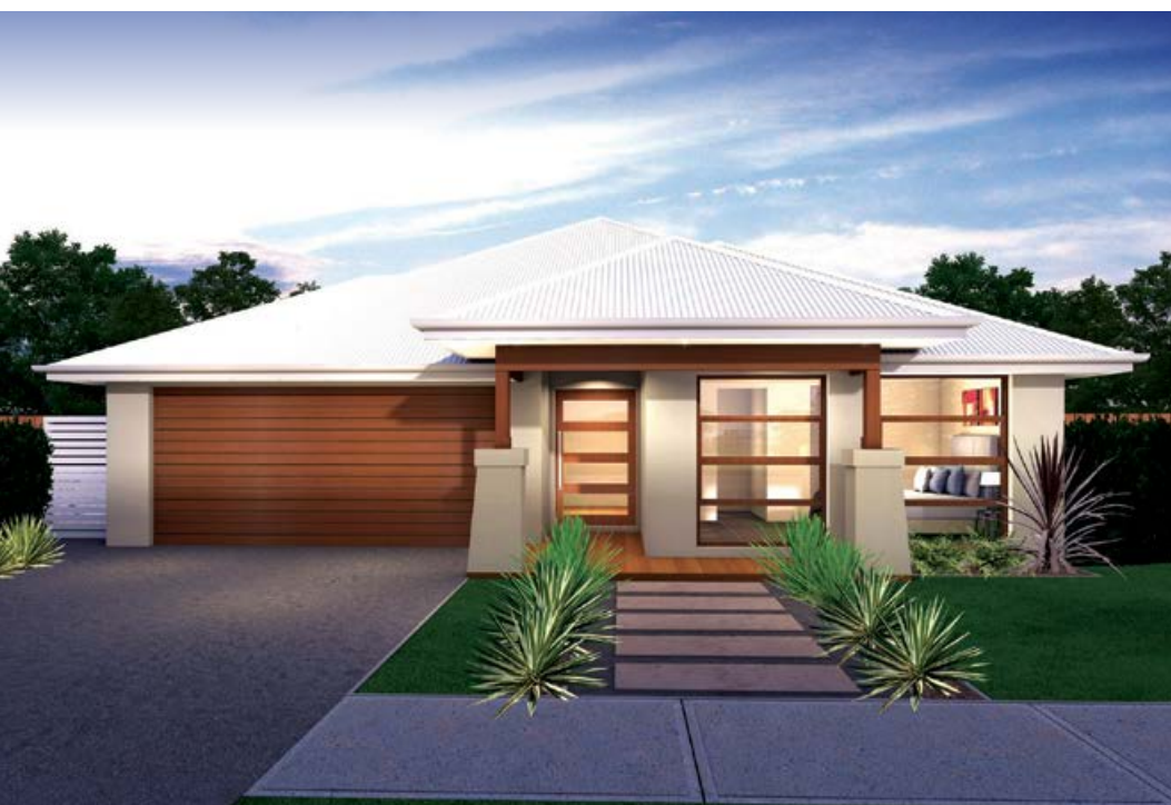
Balinese Resort F-SNDBART01 (26°)