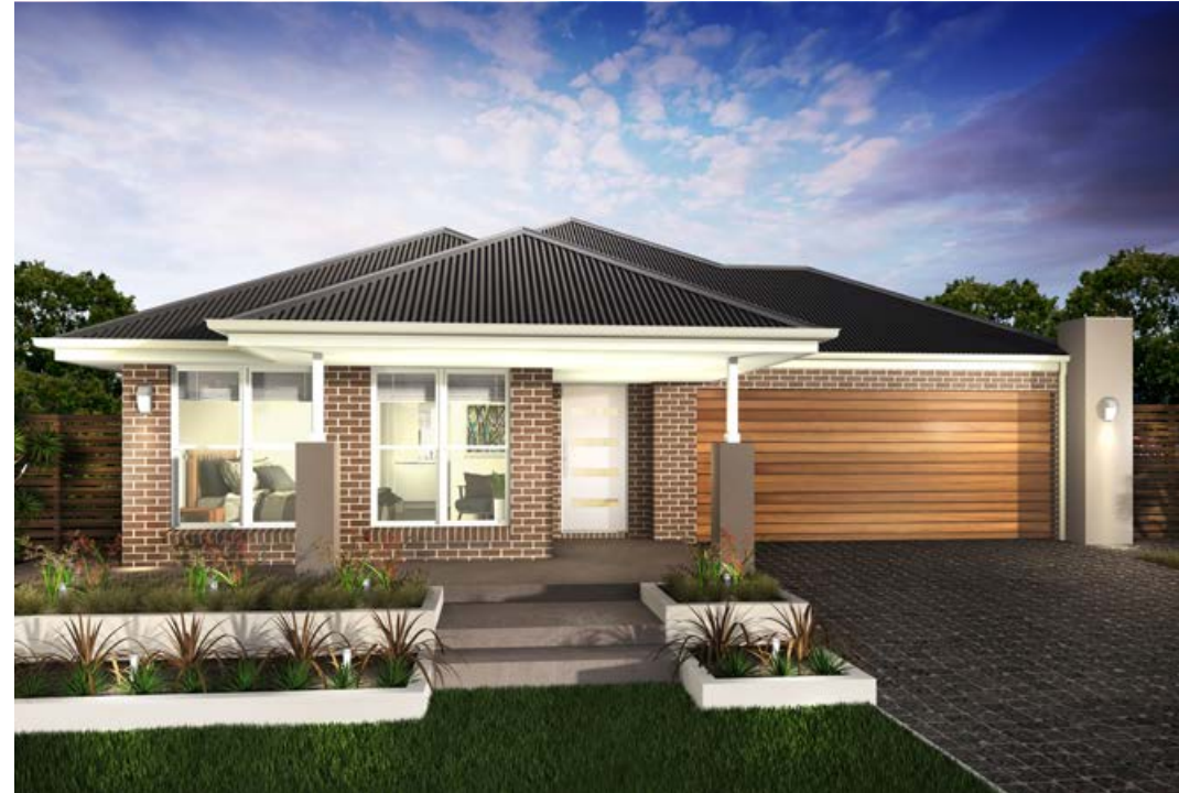
Traditional F-SNDTRAD01 (26°)