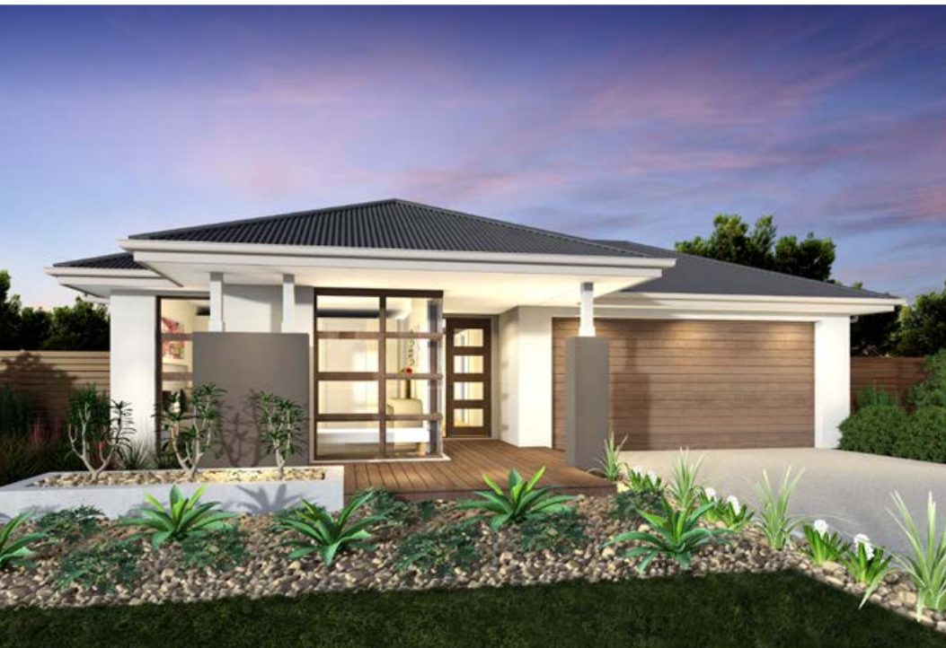
Contemporary F-SNDCTMP01 (26°)