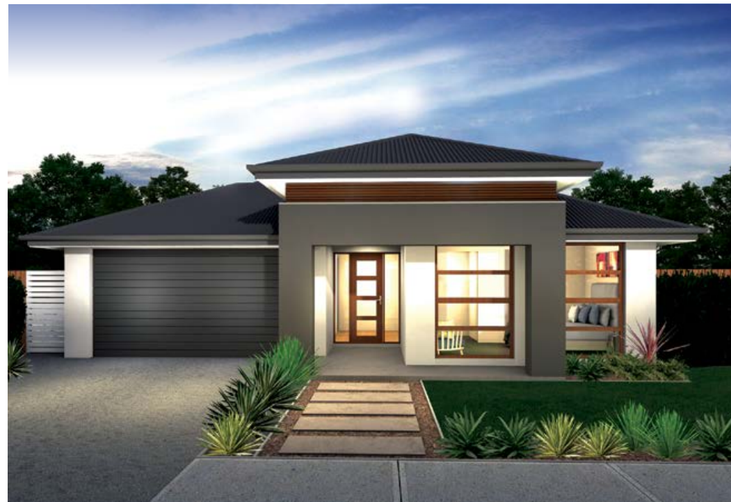
Balinese Tropicana F-SNDBATA01 (26°)