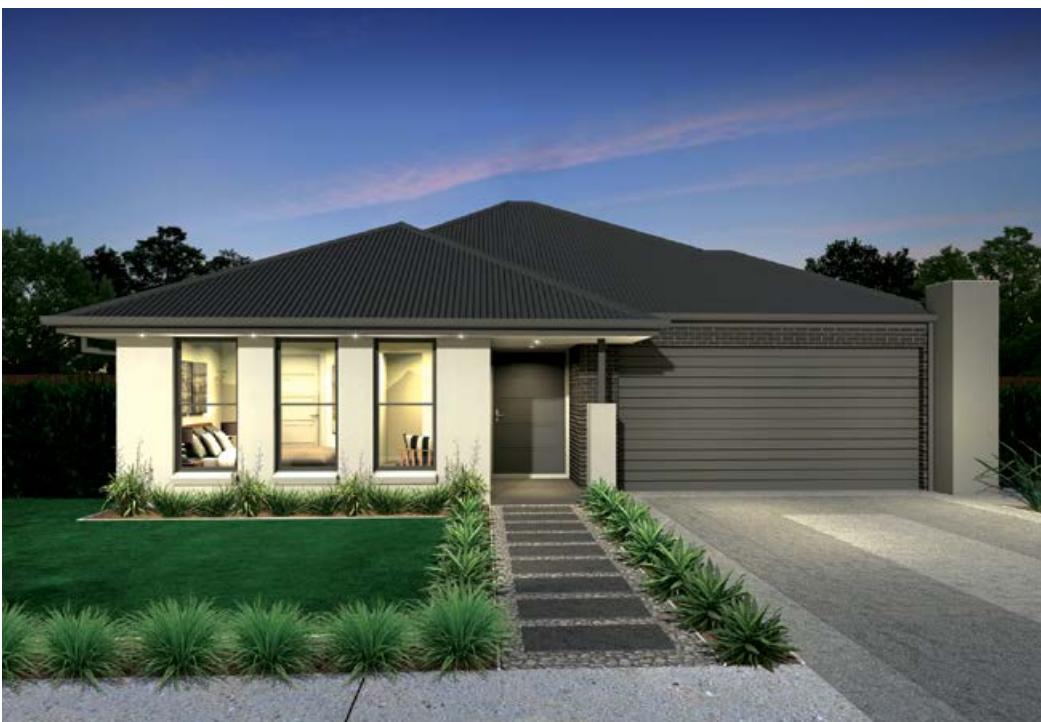
Classic F-SNDCLAS01 (26°)