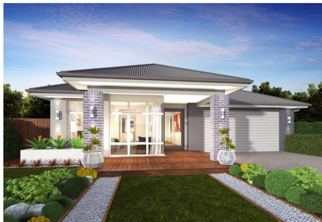
Cascade C F-SNDCASC01 (26°)