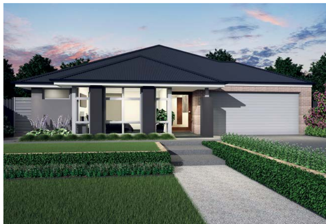
Newark F-RGCNWRK01 (26°)