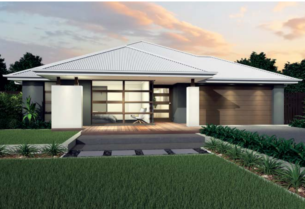
Contemporary F-RGCCTMP01 (26°)