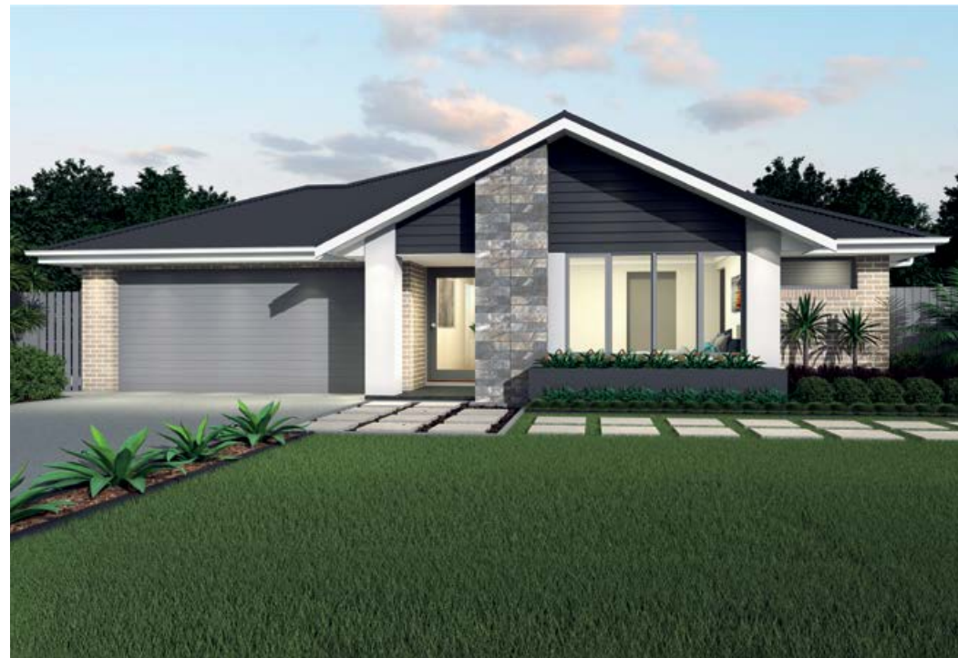
Watagan F-RGCWTGN01 (26°)