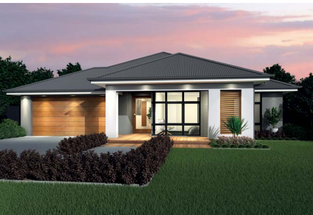
Balinese Tropicana D F-RGCBATD01 (26°)