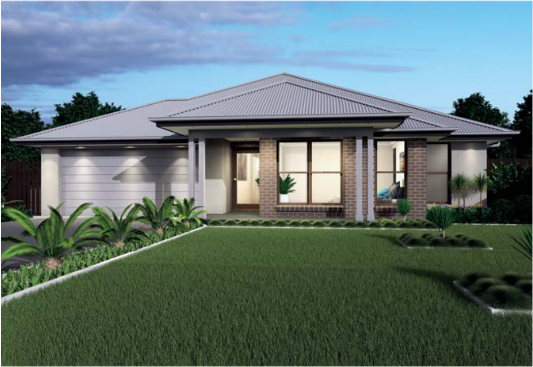
Oslo F-RGCOSLO01 (26°)