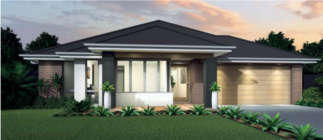
Coogee F-RGCCOGE01 (26°)