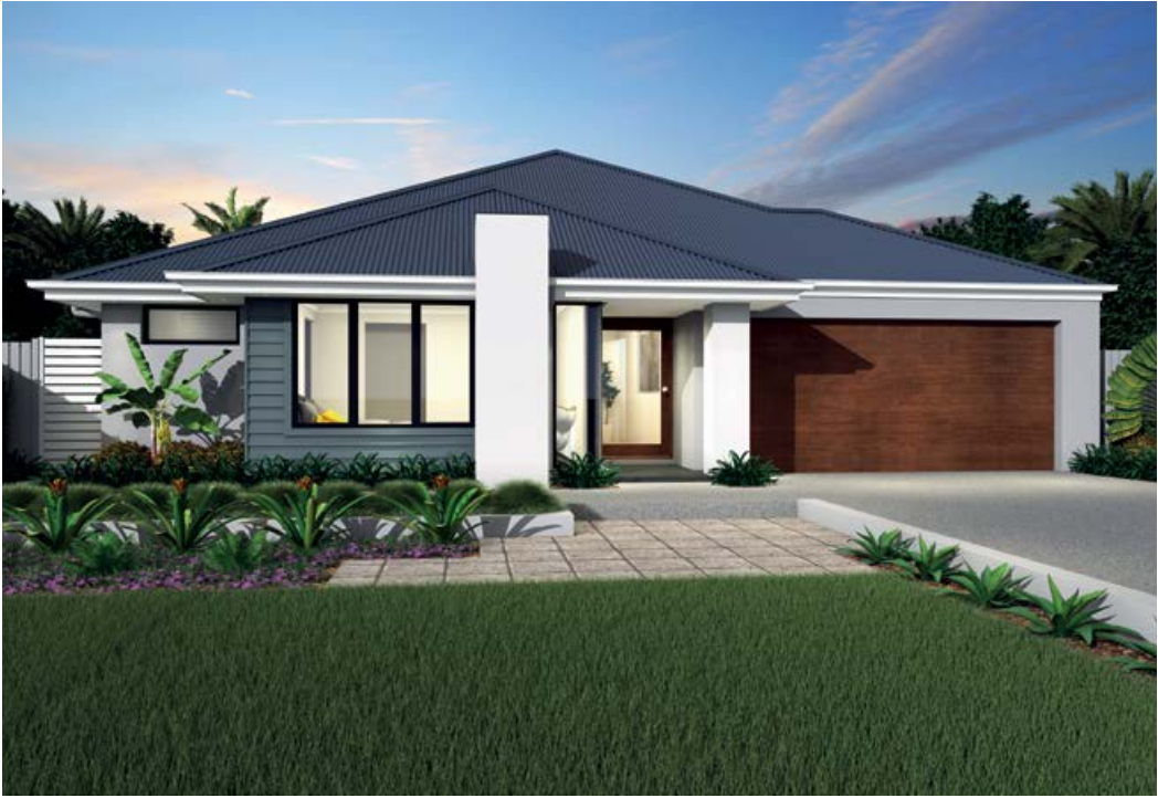
Cleanwater F-RGCCWTR01 (26°)