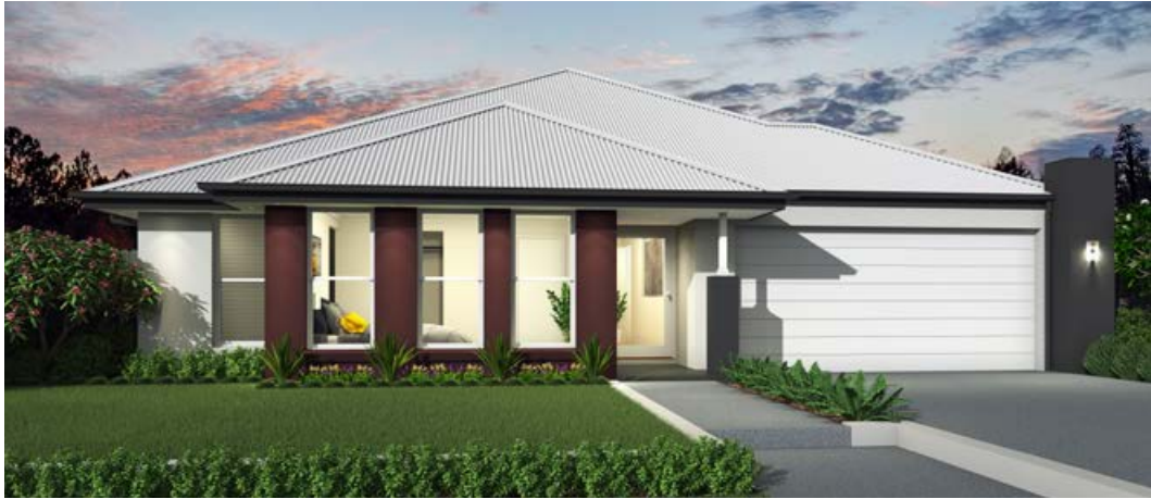
Classic F-RGCCLAS01 (26°)