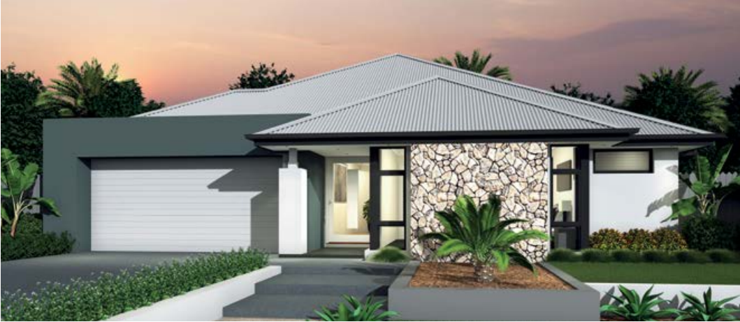
Vancouver F-RGCVCVR01 (26°)