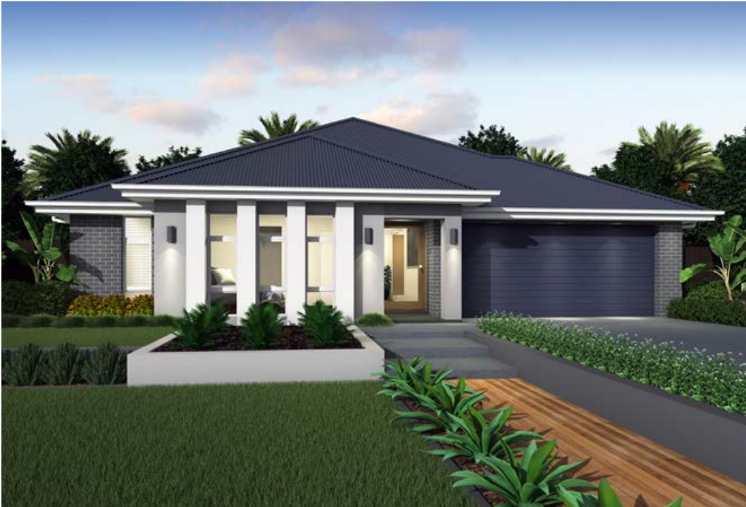
Franklin F-MLAFRNK01 (26°)