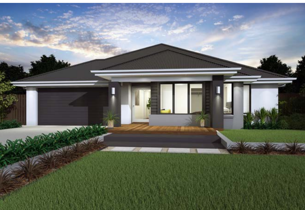
Leon F-MLALEON01 (26°)