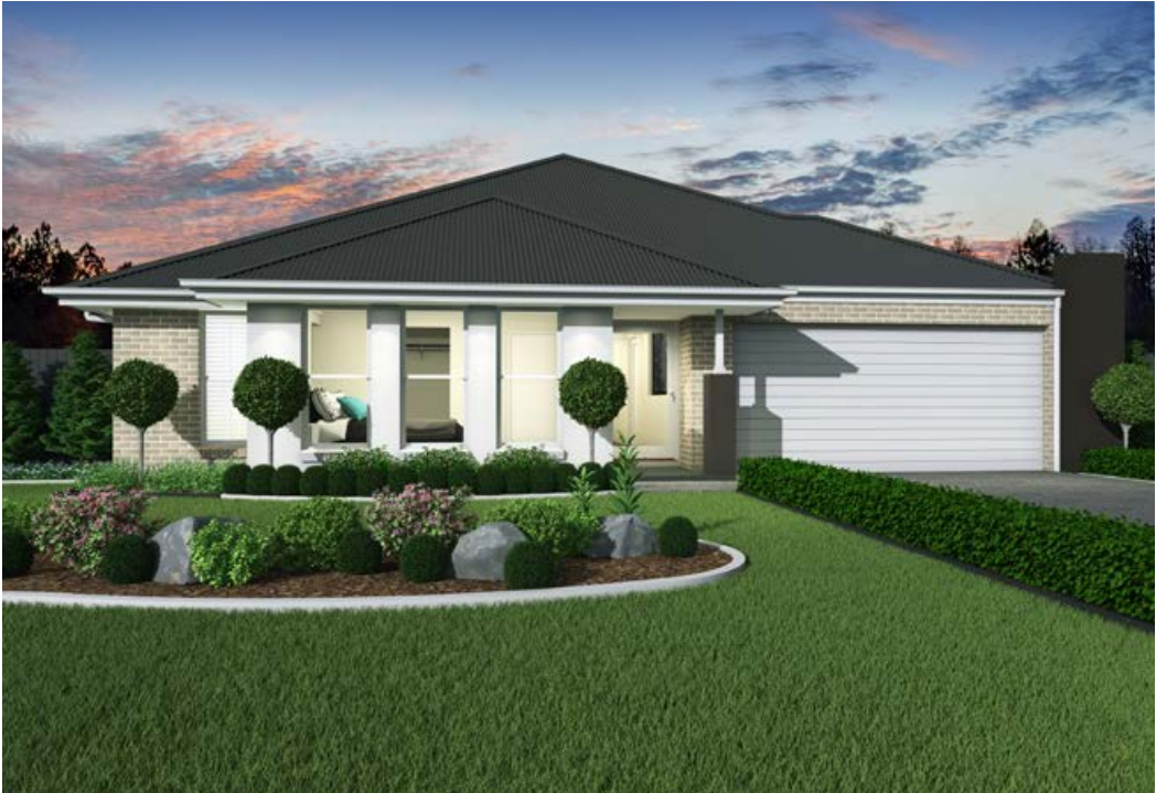
Classic F-MLACLAS01 (26°)