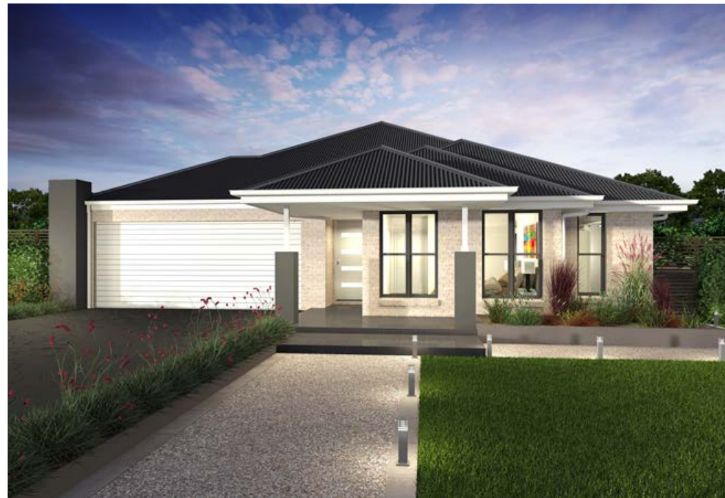
Traditional F-MLATRAD01 (26°)