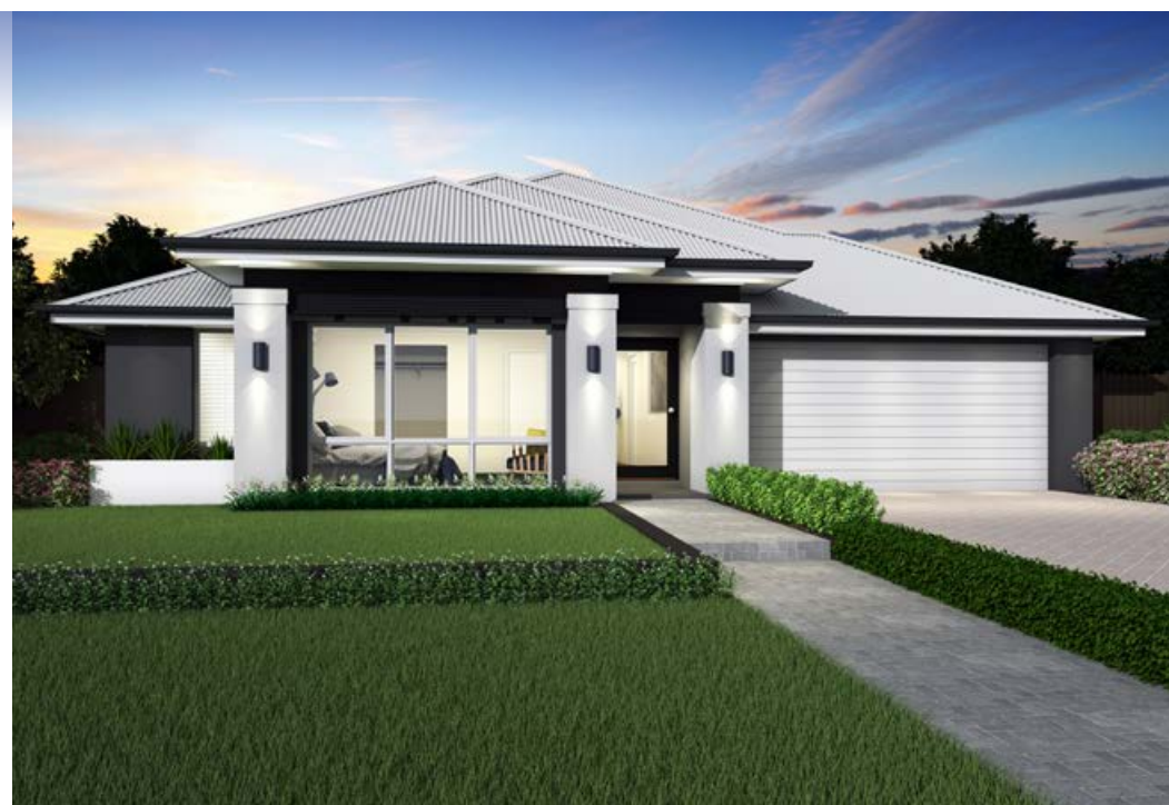
Provincial F-MLAPROV01 (26°)