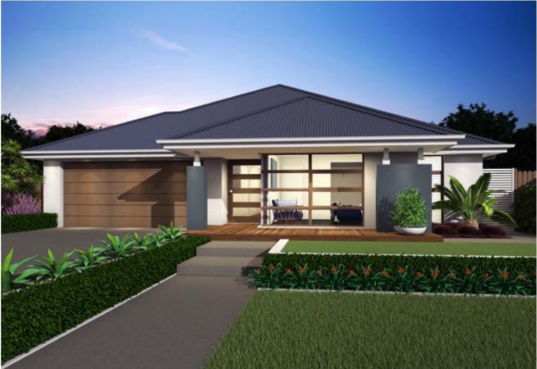
Contemporary F-MLACTMP01 (26°)