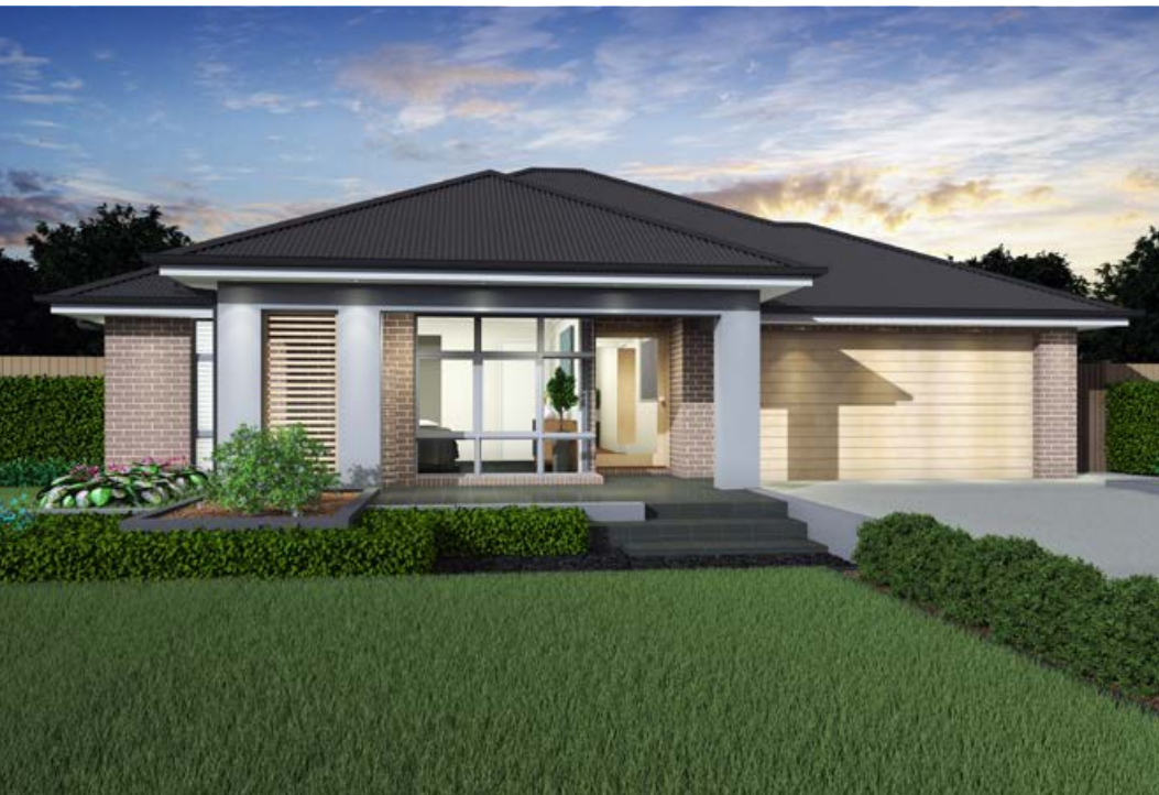
Balinese Tropicana D F-MLABATD01 (26°)