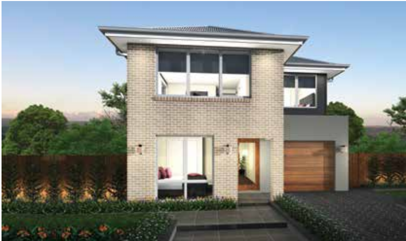
CLASSIC - (F-OKVCLASOI)