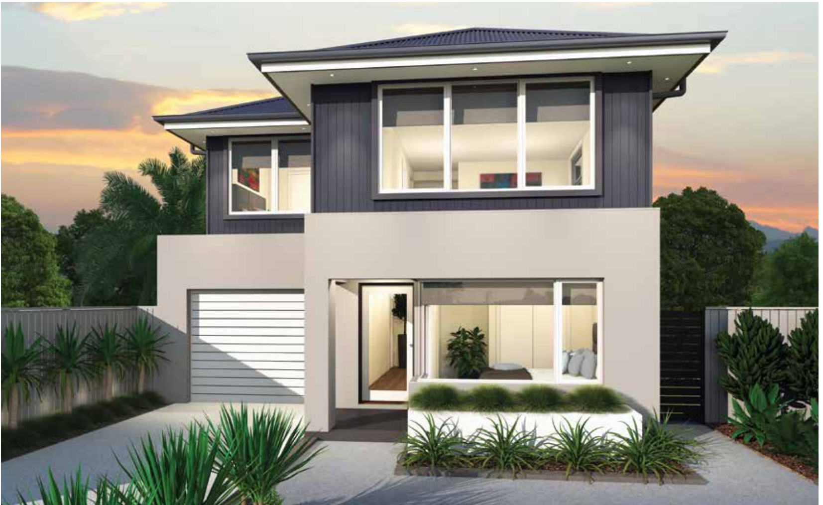
COMO - (F-OKVCOM001)