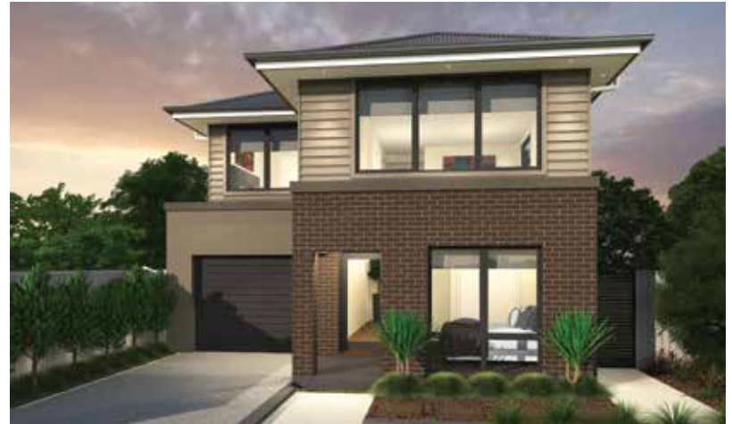
VERONA - (F-OKVVRNAOI)