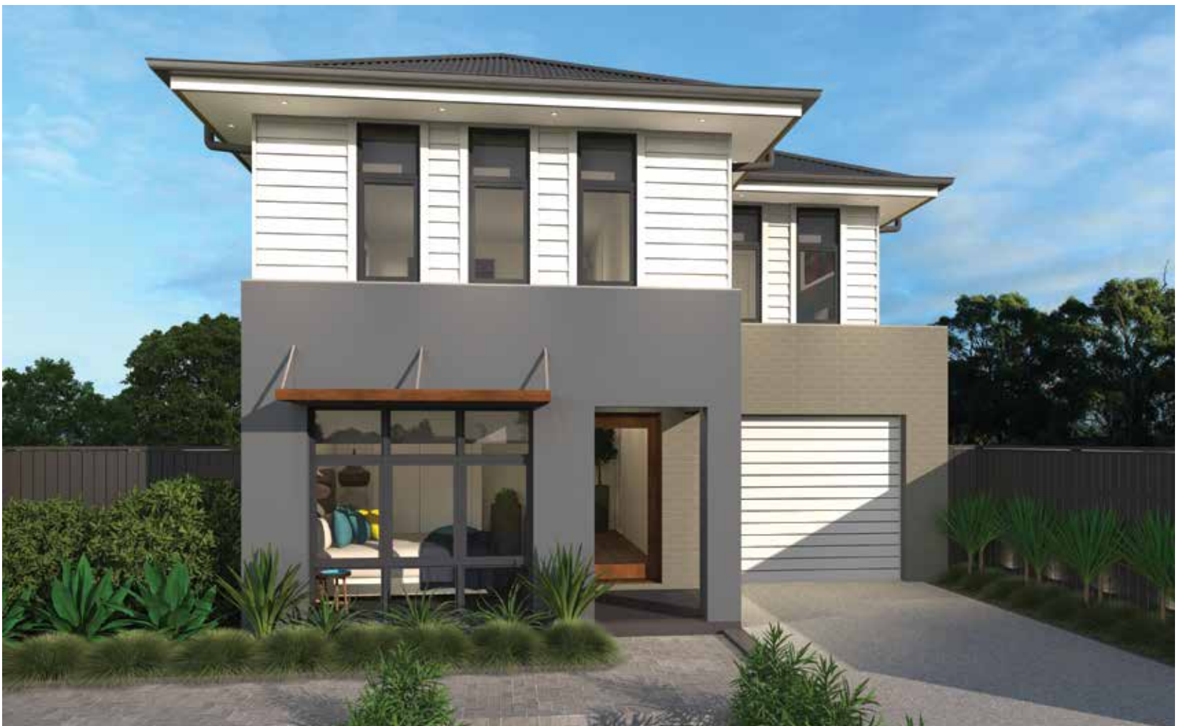
MUNICH - (F-OKVMNCHOI)