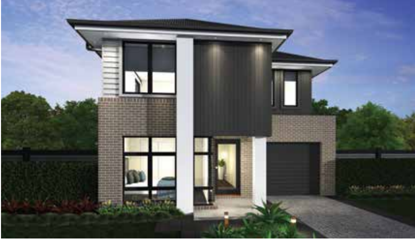
PAVIA - (F-OKVPVIA01)