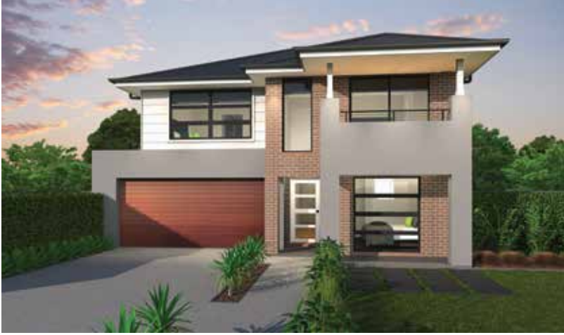
LUCCA FACADE (F-MLRLUCA01)