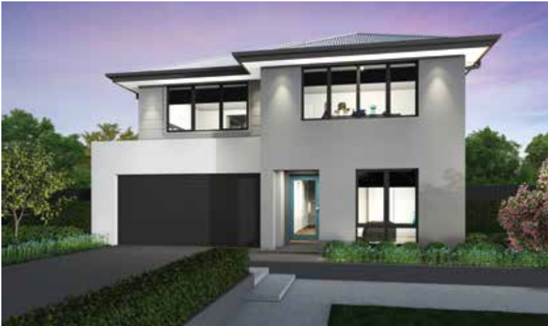
CLASSIC FACADE (F-MLRCLASOI)