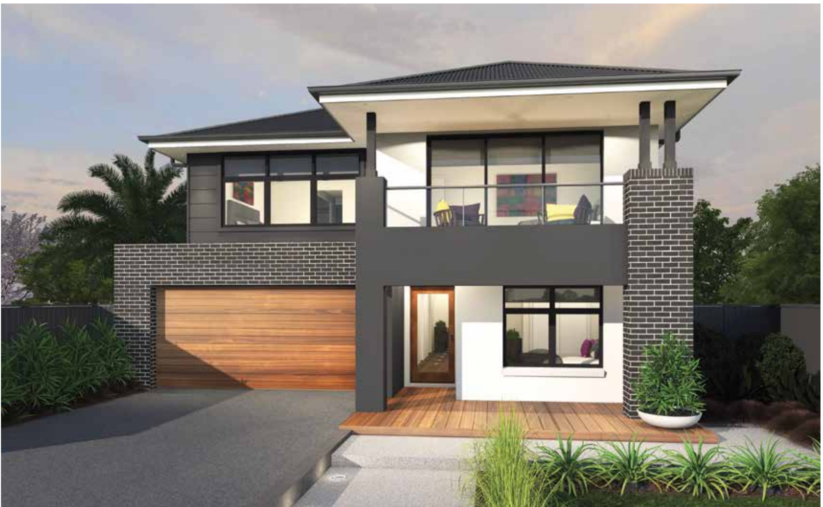
APOLLO 'B' FACADE (F-MLRAPOBOI)