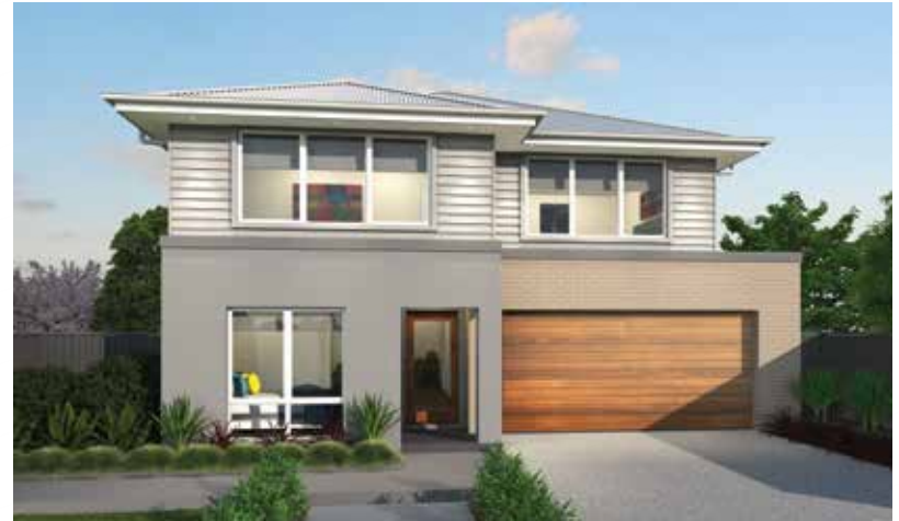
VERONA FACADE (F-MLRVRNAOI)