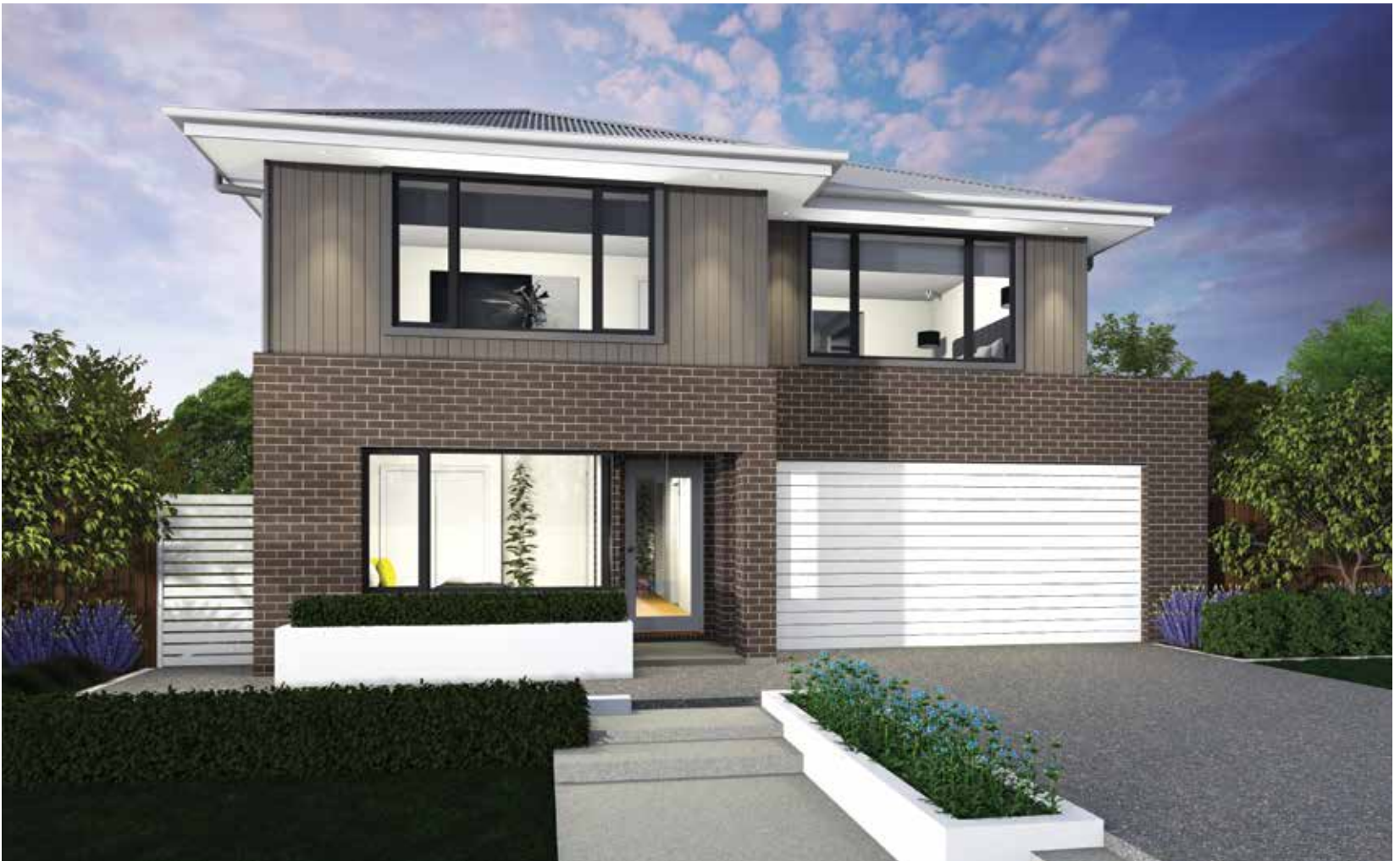
COMO FACADE (F-MLRCOMOO1)