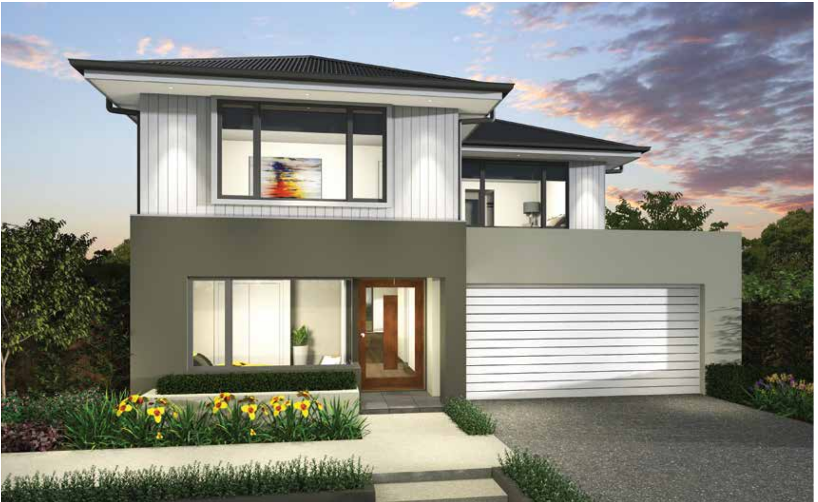
ESSEX COMO FACADE (F-ESXCOM001)