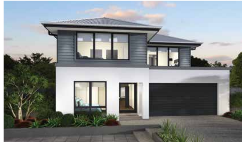
VERONA FACADE (F-ESXVRNAO1)