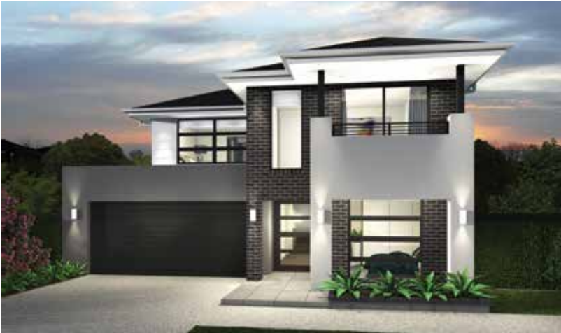
ESSEX LUCCA FACADE (F-ESXLUCA01)