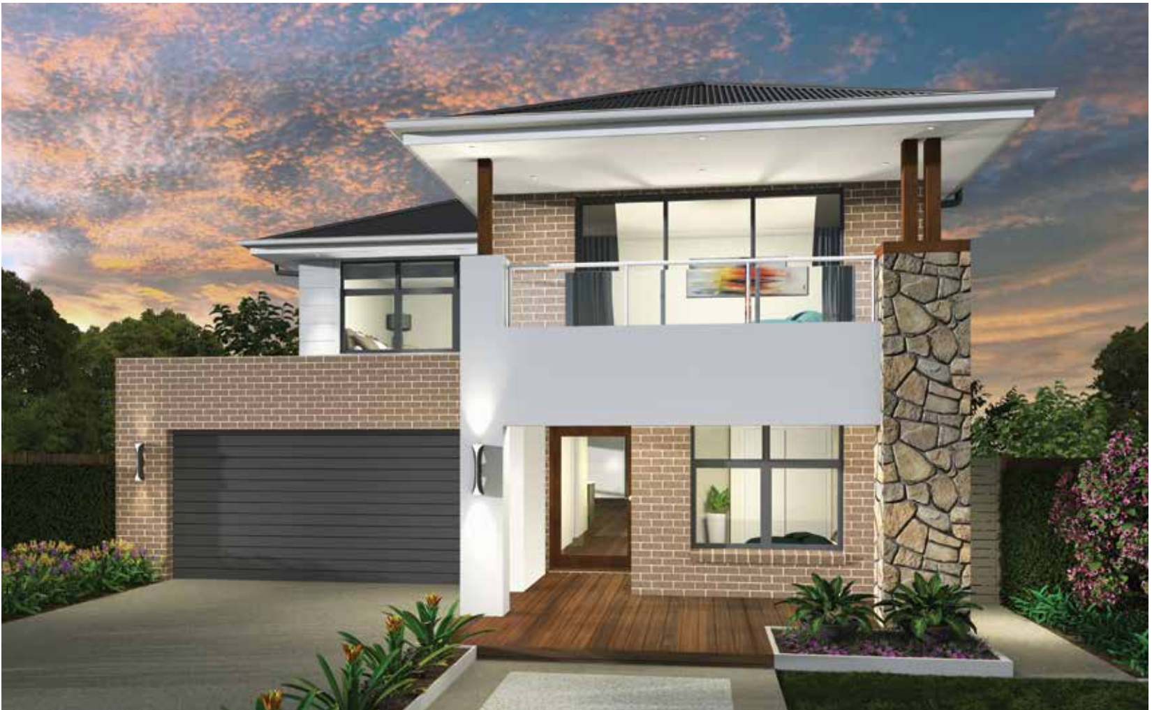
ESSEX APOLLO 'B' FACADE (F-ESXAPOB01)