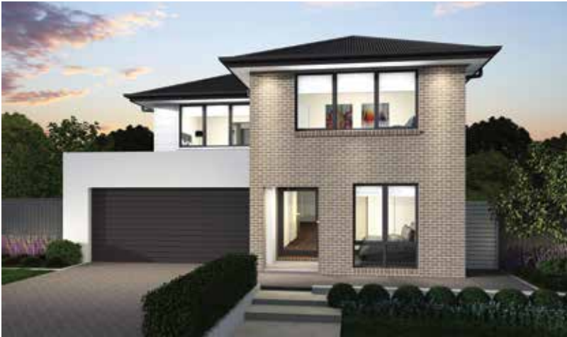
CLASSIC FACADE (F-ESXCLASO1) )